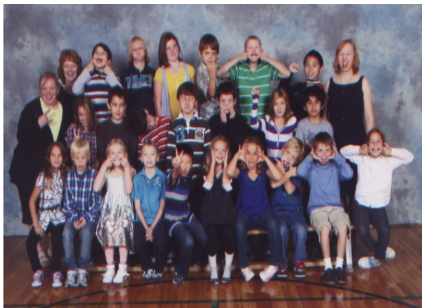
Regency Acres Public School