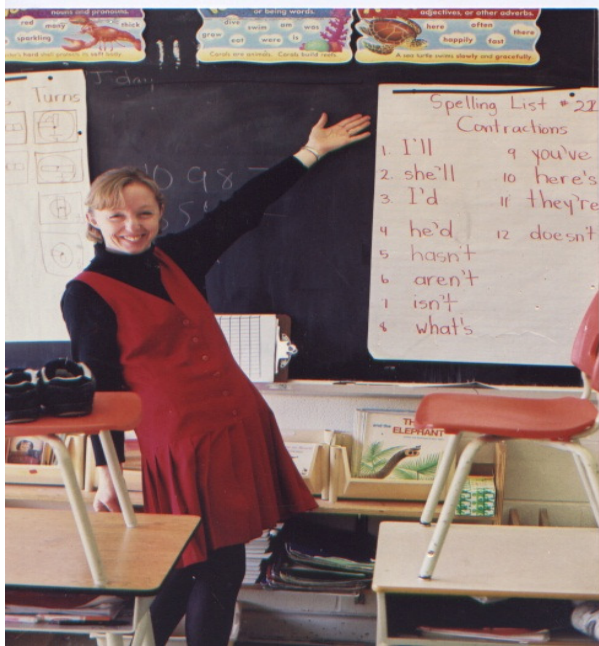
Regency Acres Public School